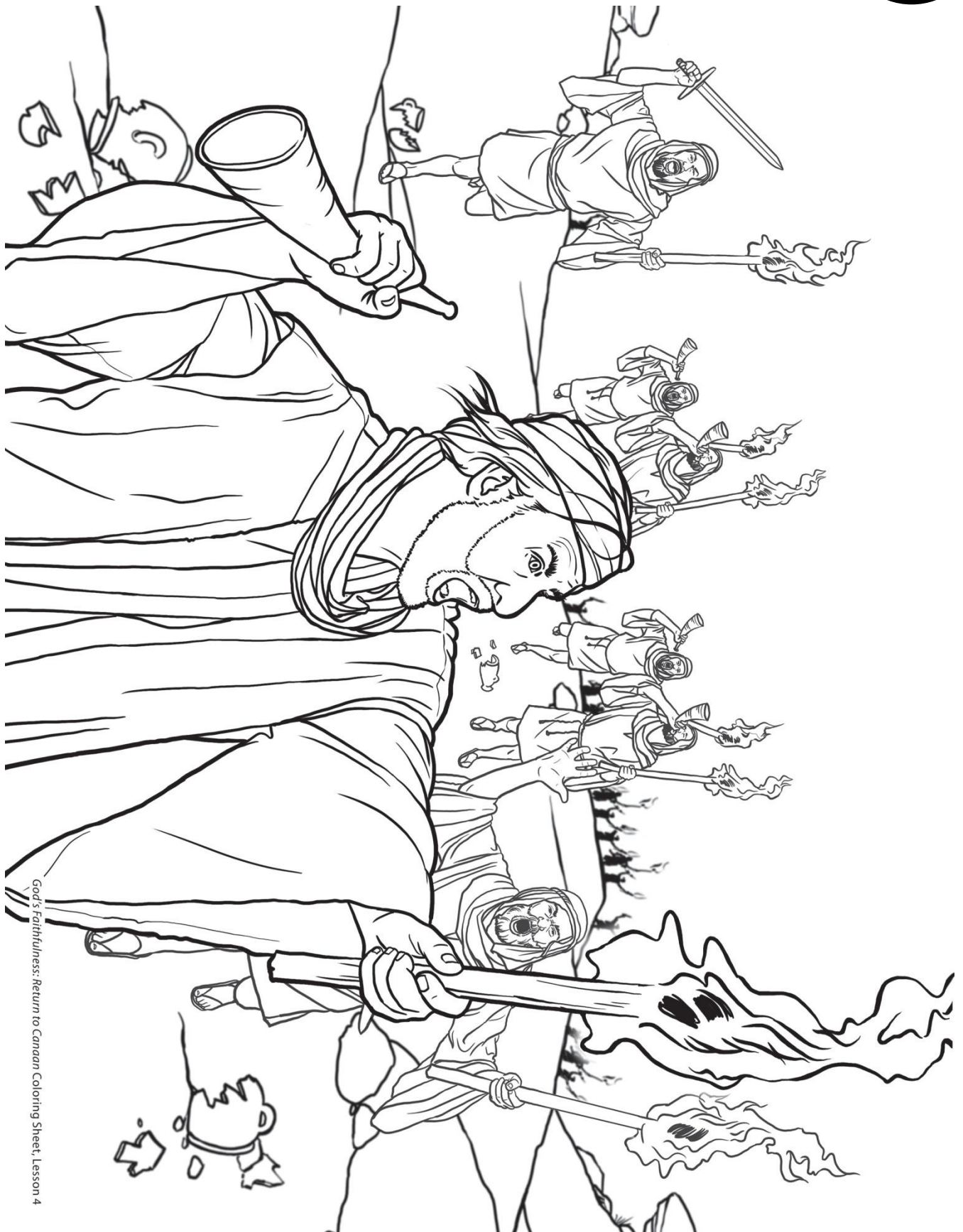
God's Faithfulness: Return to Canaan Coloring Sheet, Lesson 4